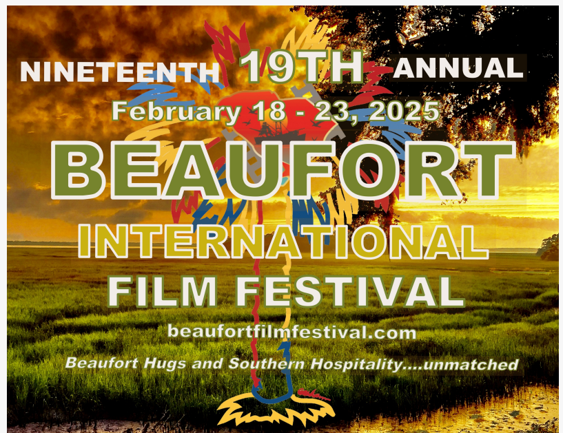
Beaufort International Film Festival 2025