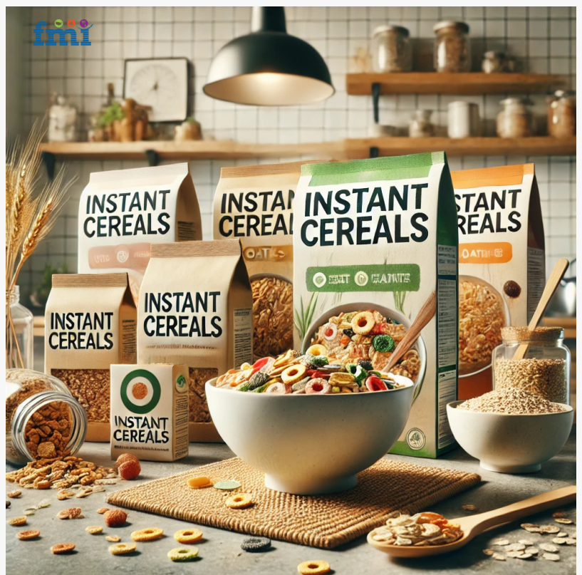
Instant Cereals Market

Instant cereals, known for their quick preparation and nutritional value, include a variety of products such as oatmeal, granola, and fortified cereals. These products cater to diverse consumer preferences, including organic, gluten-free, and high-protein options, making them appealing to a