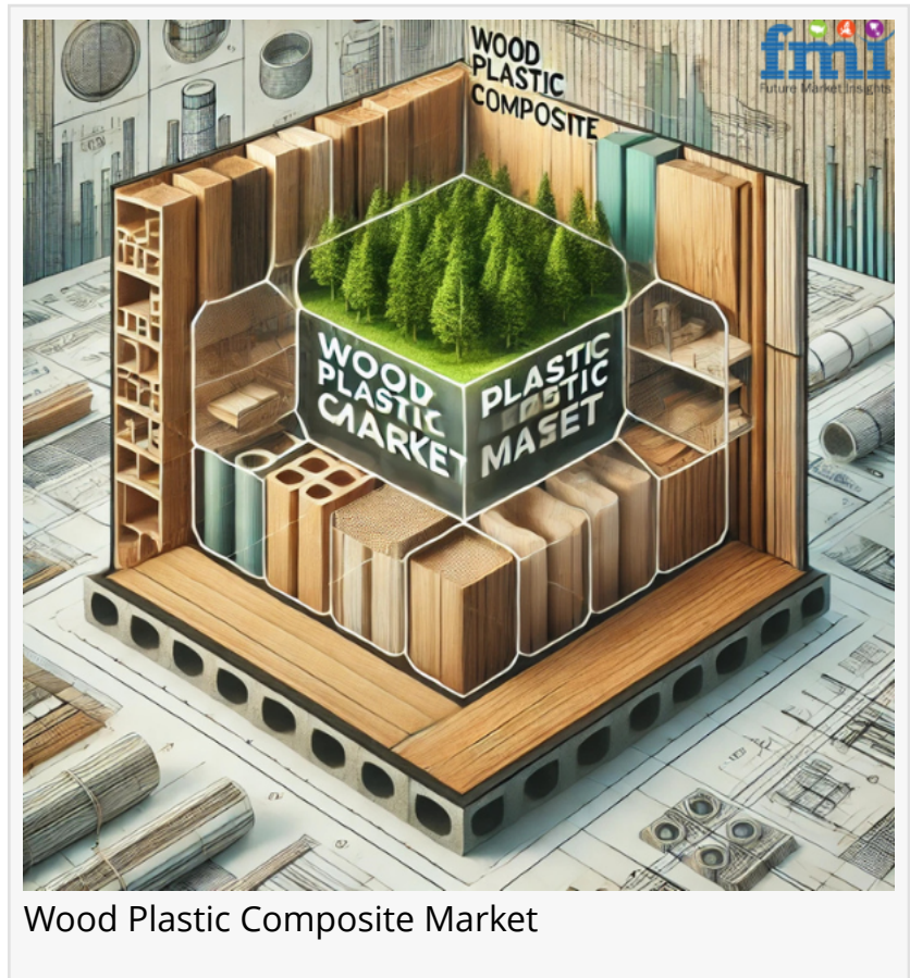
Wood Plastic Composite Market

NEWARK, DE, UNITED STATES, January 9, 2025 /EINPresswire.com/ -- The wood plastic composite market , valued at USD 6,914.1 million in 2024, is poised for significant growth, with a projected CAGR of 10.3% over the next decade. This dynamic sector is expected to reach an impressive USD 18,498.9 million by 2034, driven by the increasing demand for sustainable building materials, particularly in applications such as decking, flooring, and outdoor furniture. As consumers and industries alike continue to prioritize eco-friendly solutions, WPC's blend of wood and plastic offers a durable, low-maintenance alternative, positioning the market for substantial expansion throughout the forecast period.