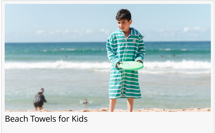
Beach Towels for Kids

The Zippy Kids collection offers a versatile solution for a variety of activities, from post-swim wrap-ups to picnics by the water. The kids beach towels provide ample coverage and protection, featuring a UPF50+ rating to shield children from harmful UV rays during outdoor adventures.