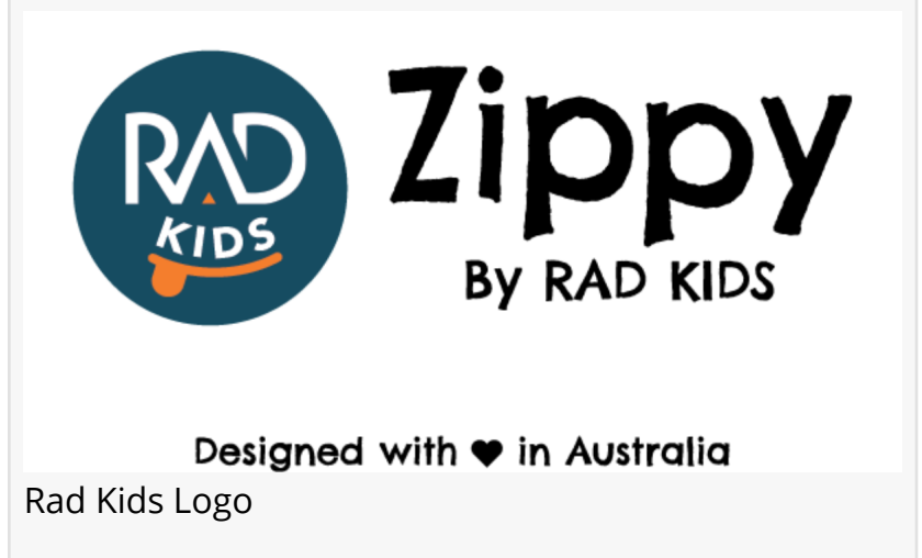
Rad Kids Logo