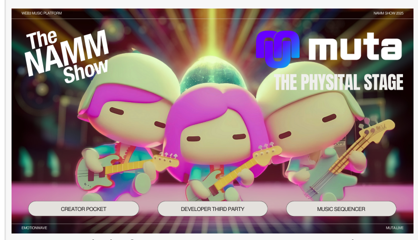
MUTA Pistil Platform THE NAMM SHOW Branding Image

industries, will participate in the event, showcasing their latest technologies and innovative products. NAMM SHOW generates an economic impact of over $50 billion annually and plays a crucial role in presenting the global vision of the music and instrument industry.