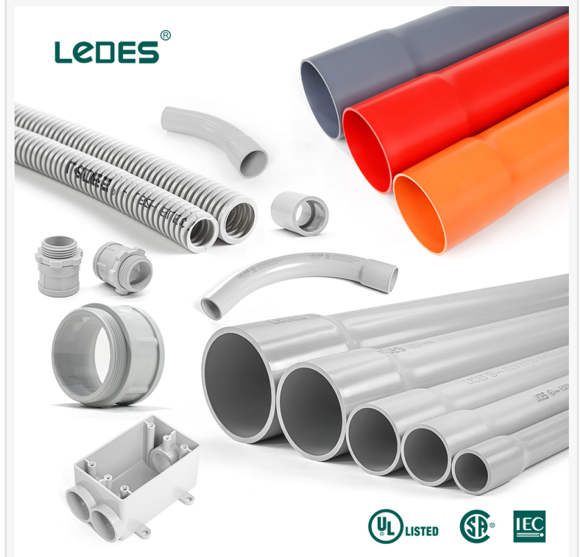
Ledes UL & CSA Certified Electrical Conduit Manufacturer