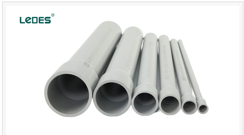
Ledes UL Listed Schedule 80 Conduit

Electrical conduit acts as a protective shield for electrical wiring, safeguarding it from physical damage, environmental factors, and accidental contact. Imagine your wiring as vital arteries within a building; conduit ensures their smooth flow and