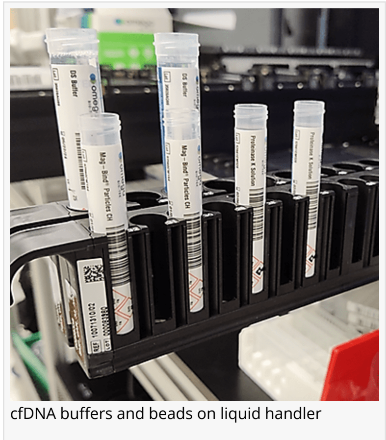
cfDNA buffers and beads on liquid handler

This press release can be viewed online at: https://www.einpresswire.com/article/774557551