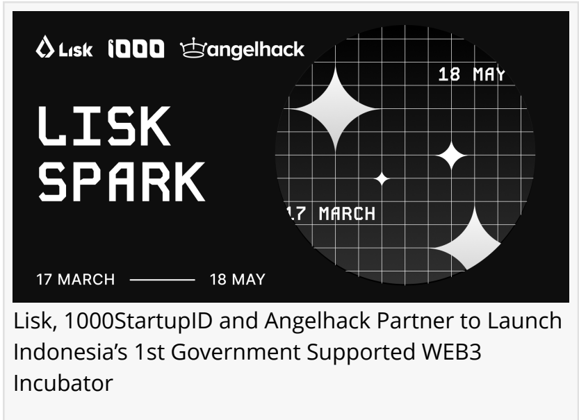
Lisk, 1000StartupID and Angelhack Partner to Launch Indonesia's 1st Government Supported WEB3 Incubator

JAKARTA, INDONESIA, January 9, 2025 /EINPresswire.com/ -- Lisk , AngelHack , and 1000StartupID have partnered to introduce Lisk Spark , Indonesia's first government-supported Web3 incubator, offering a complete ecosystem to help entrepreneurs build and scale decentralized applications (dApps). Participants benefit from both technical expertise and business development support, ensuring a well-rounded foundation for sustainable ventures.