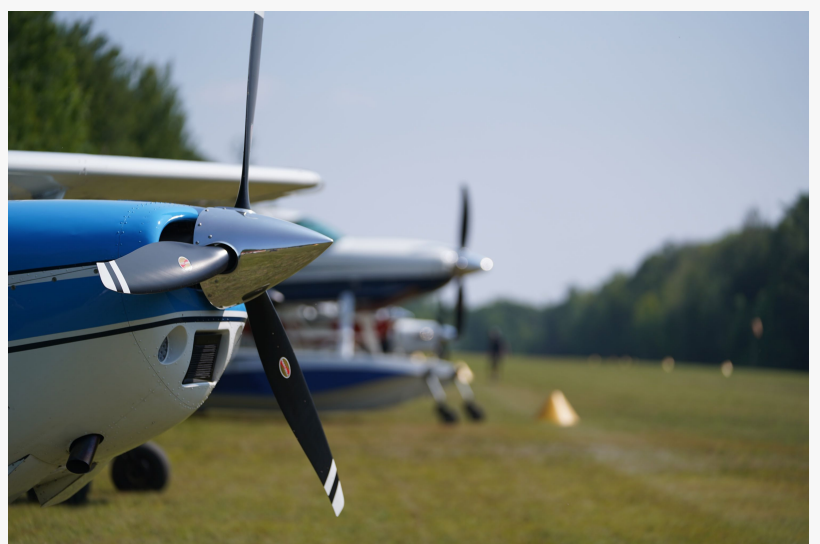
Hartzell Voyager Propeller on Cessna 185

These propellers are designed to improve backcountry performance, enhancing takeoff and climb capabilities to navigate remote environments.