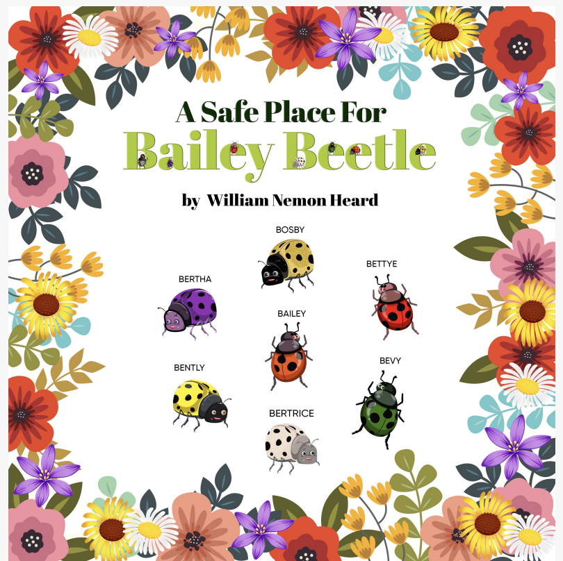
COVER - A Safe Place For Bailey Beetle