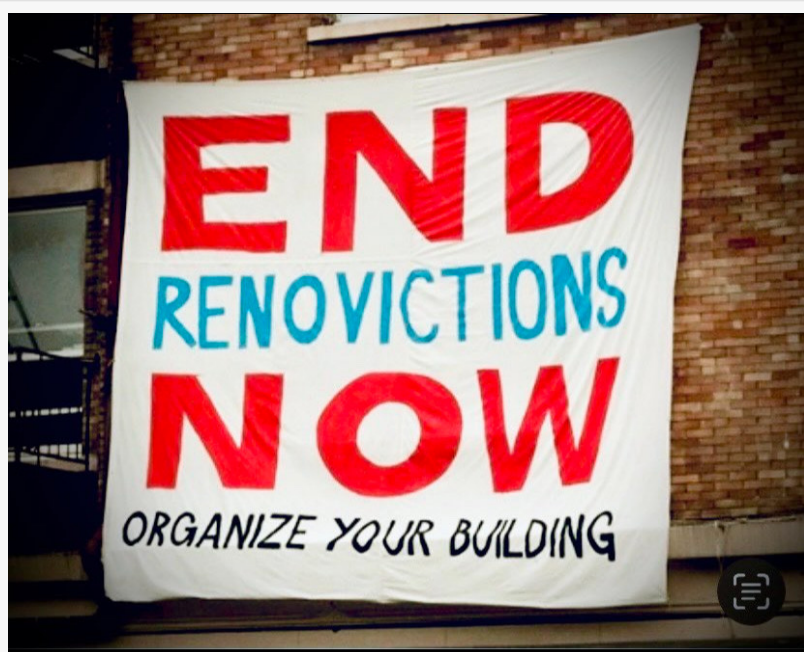
End Renovictions Now

This novel is more than just fiction—it's a challenge to confront the issues at the heart of the housing crisis and to understand the deeper forces that keep people from thriving. It's a call to action for anyone who has had enough of the corruption and inequality driving the crisis.