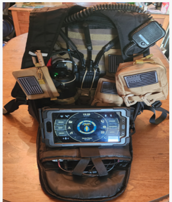
Cloud WAN backpack

The TMMC is a sophisticated network that allows data to flow through multiple paths simultaneously, such as Tactical Radios, Broadband Internet, LTE, 5G Cellular, and uniquely satellites, ensuring everything runs efficiently and reliably. At setup, the TMMC provides operators with the ability to manually select and shift communications providers and communication types used.