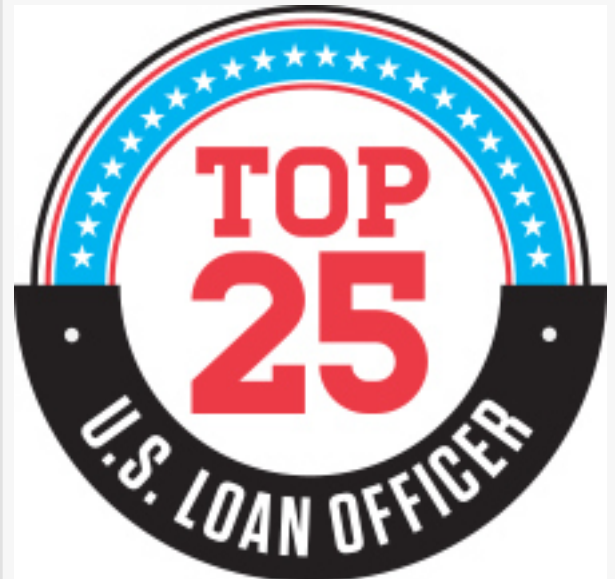
Top 25 US Loan Officer

This press release can be viewed online at: https://www.einpresswire.com/article/772338827