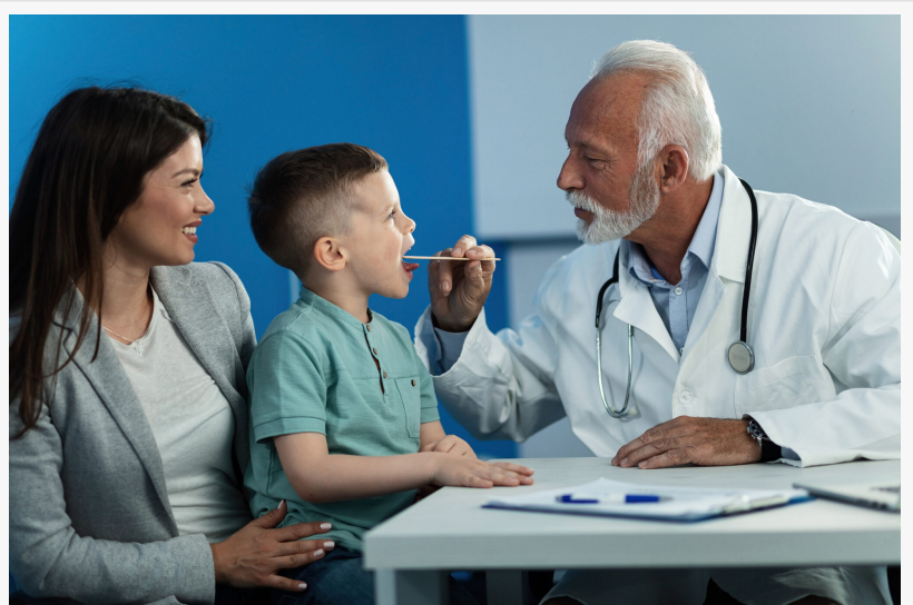
best Children ENT Specialist