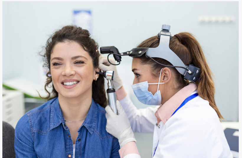
ENT Surgeon Milton Keynes

This press release can be viewed online at: https://www.einpresswire.com/article/772165136 EIN Presswire's priority is source transparency. We do not allow opaque clients, and our editors try to be careful about weeding out false and misleading content. As a user, if you see something we have missed, please do bring it to our attention. Your help is welcome. EIN Presswire, Everyone's Internet News Presswire™, tries to define some of the boundaries that are reasonable in today's world. Please see our Editorial Guidelines for more information. © 1995-2024 Newsmatics Inc. All Right Reserved.