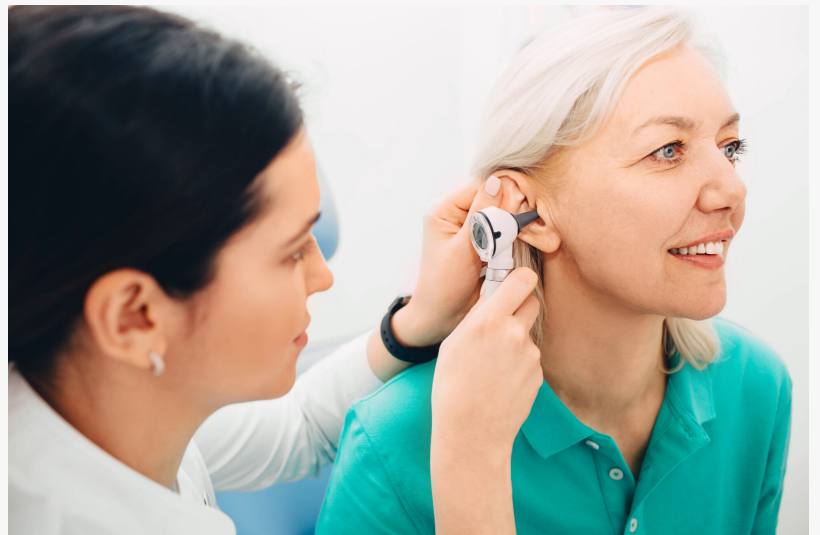
ENT Specialist Northamptonshire