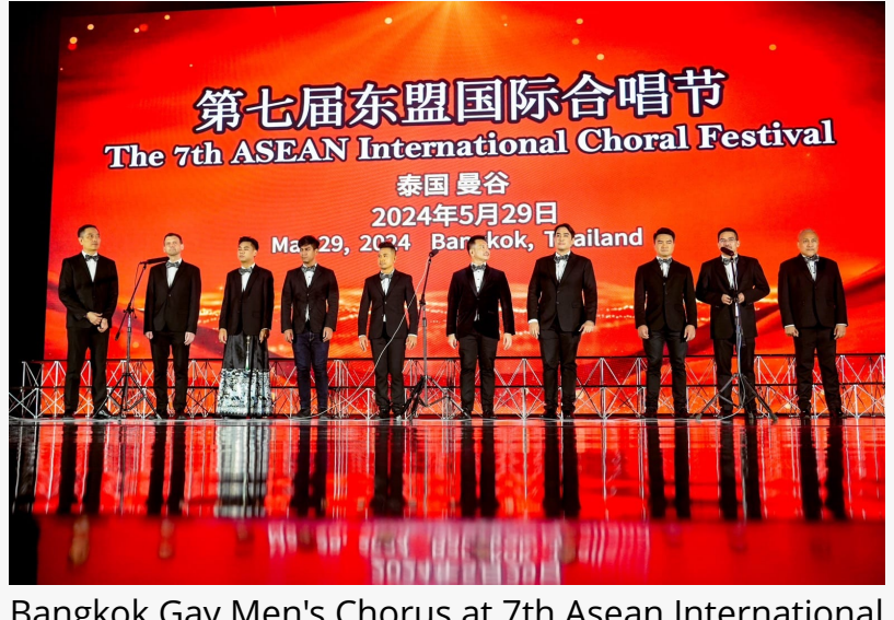
Bangkok Gay Men's Chorus at 7th Asean International Choral Festival

5. Thailand International Choral Festival (September 3-6): As a featured performer at the inaugural event, BKGMC cemented its reputation as a leader in Thailand's choral music and LGBTQ+ advocacy scenes.