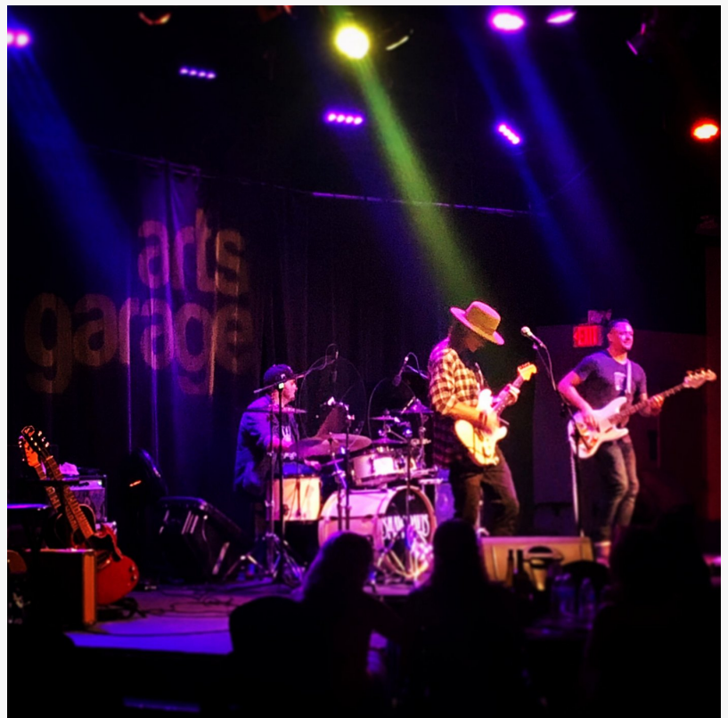
Arts Garage Live Show