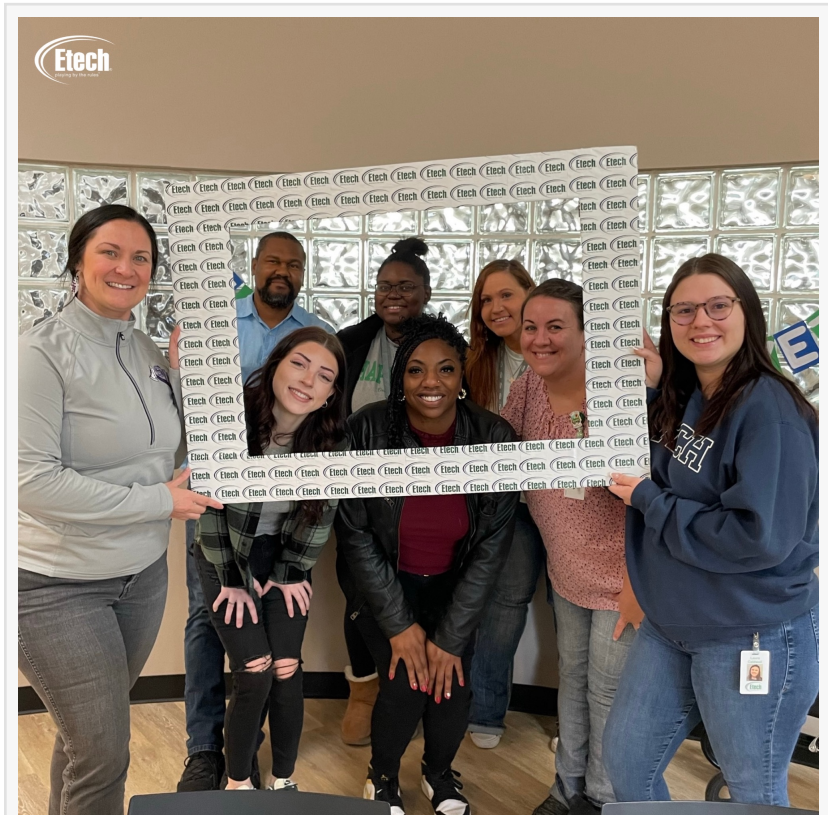
America's Dream Employer 2025