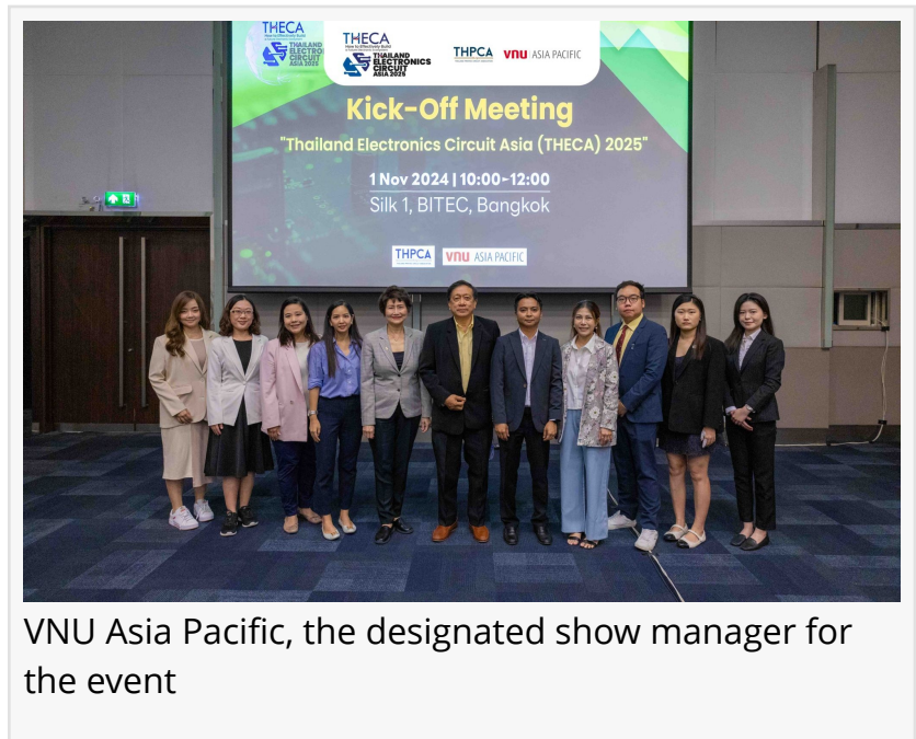
VNU Asia Pacific, the designated show manager for the event

The Thailand Electronics Circuit Asia 2025 (THECA 2025) endeavors to establish Thailand as a global center for Printed Circuit Board (PCB), Printed Circuit Board Assembly (PCBA), and Electronic Manufacturing Service (EMS) production. Under the theme "How to Effectively Build a Future Electronics Ecosystem," the event underscores the critical importance of strengthening local supply chains, fostering investment opportunities, and facilitating technology exchange. Moreover, THECA 2025 prioritizes sustainable development through strategic collaboration among government entities, private sector stakeholders, and industry manufacturers, while advancing net-zero carbon initiatives and enhancing workforce competencies to meet the demands of future markets.