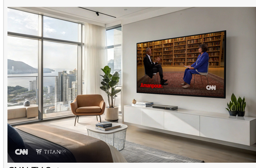
CNN TV Set

it offers a curated selection of high-quality channels.