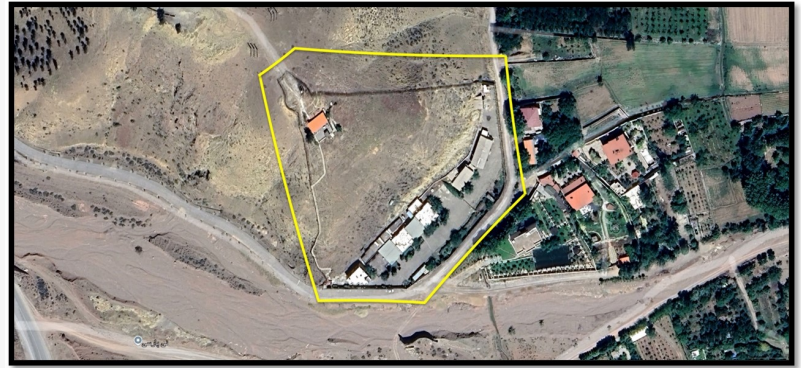
New 2024 imagery of the Sanjarian site, newly renamed Meshkat complex, disclosed during a press conference held by NCRI-US to reveal critical information about Iran's nuclear weaponization program, December 19, 2024, Washington, DC

He urged the international community and the IAEA to focus not just on the quantity and enrichment levels of uranium but on the weaponization aspects of Iran's nuclear activities. The