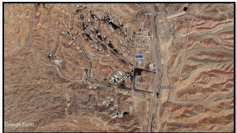
New 2024 Satellite Imagery of Plan Area 6 with new structures, disclosed during a press conference held by NCRI-US to reveal critical information about Iran's nuclear weaponization program, December 19, 2024, Washington, DC