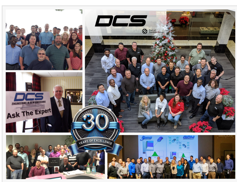
DCS has grown from humble beginnings to the leader in dimensional management

TROY, MI, UNITED STATES, December 19, 2024 /EINPresswire.com/ -- Dimensional Control Systems (DCS) proudly commemorates its 30th anniversary. Established in 1994 with a small yet dedicated team, DCS has grown into a leading software development firm, offering two comprehensive software suites supported by a team of expert engineers.