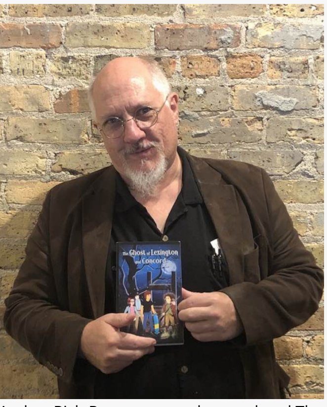
Author Rich Rostron recently completed The Ghost of Lexington and Concord, a novel of historical fiction and a ghostly adventure.

This press release can be viewed online at: https://www.einpresswire.com/article/770435542