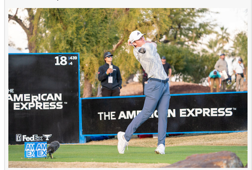
Nick Dunlap, The American Express® Defending Champion