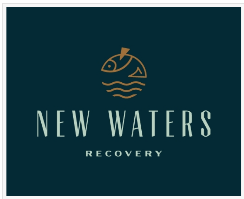
New Waters Recovery & Detox North Carolina

Located at 3810 Bland Rd, Raleigh, NC, New Waters Recovery serves as a beacon of hope for individuals grappling with substance use disorders and mental health challenges. The center focuses on dual-diagnosis care, offering two distinct programs: