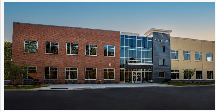
New Waters Recovery Building