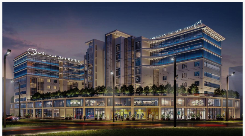
Dragon Palace Hotel Exterior