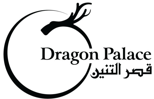
Dragon Palace Hotel Logo

His leadership also embodies the hotel's vision: