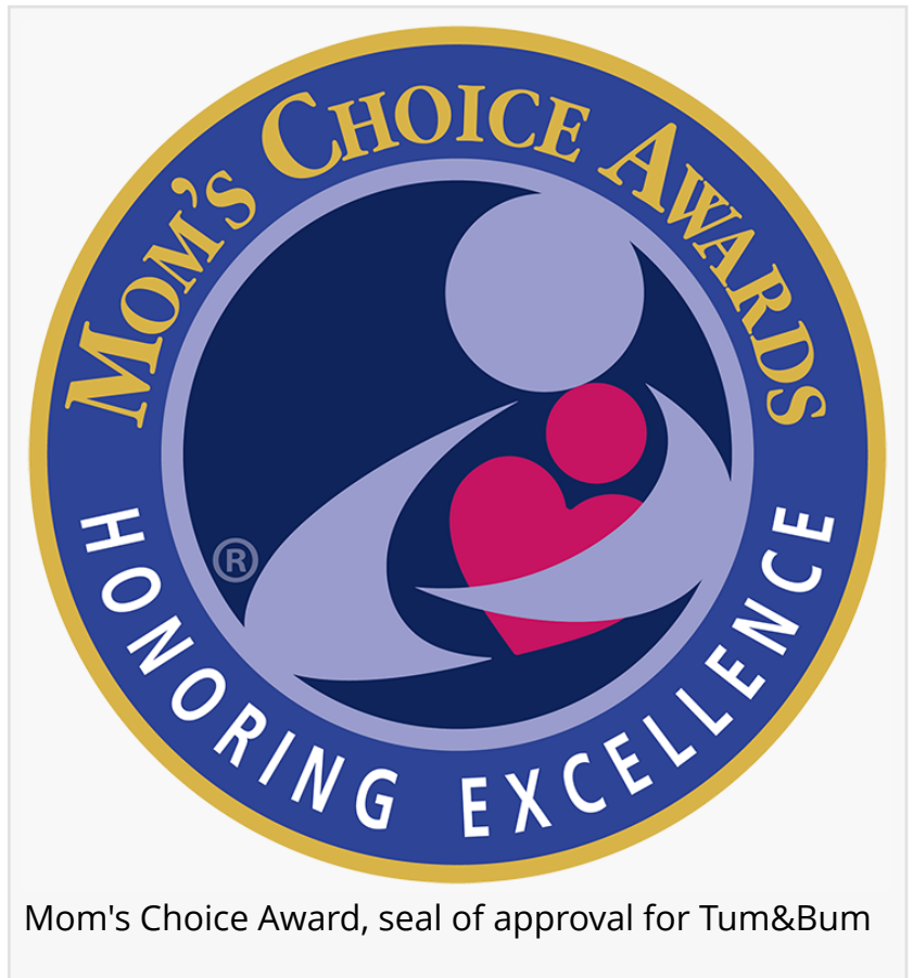
Mom's Choice Award, seal of approval for Tum&Bum

McAdam also noted, "This award comes at a crucial time, as pediatric flu cases are rising while vaccination rates are alarmingly low this season, according to the latest reports from the Centers for Disease Control and Prevention (CDC). Only 37 percent of U.S. children received the influenza vaccine this year, despite a record number of child fatalities from the flu last year. Tum&Bum provides a safe and holistic option for parents, caregivers, and educators to comfort children