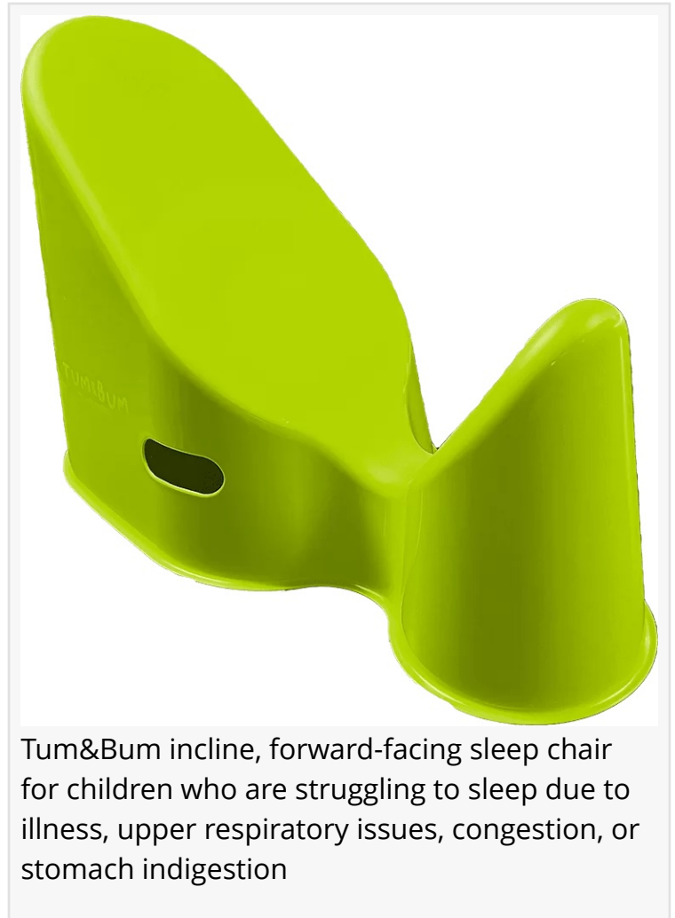
Tum&Bum incline, forward-facing sleep chair for children who are struggling to sleep due to illness, upper respiratory issues, congestion, or stomach indigestion

The Mom’s Choice Awards submission process is meticulous. Each applicant submits five identical samples for testing, which are evaluated by a matched panel of experts who adhere to a strict code of ethics to ensure objectivity. These evaluations are then presented to the MCA Executive Committee for final review and approval.