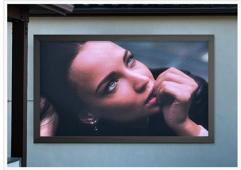
Double R Apartment Complex in Reno, NV has three YOLO TVs this 158 inch is on the rooftop and they opted to elevate the TV with a custom bezel around the frame

"It's gorgeous. I've never had anything like this at any property or seen