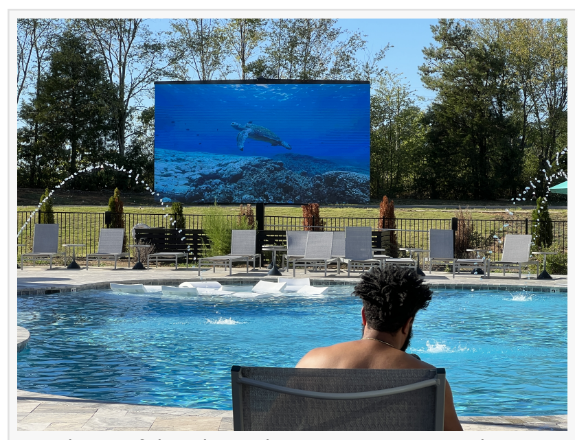
Residents of the Alexandria Apartment Complex Enjoying the TV while swimming and relaxing on a sunny day!

As exceptional entertainment spaces and outdoor oases become increasingly sought after, properties equipped with giant, daylight-bright TVs are setting themselves apart in a competitive market.