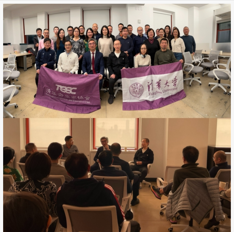
Chairman Jiangtao Sun of CBiBank Explores the Future of Commercial Banking at TEEC 2024 Conference