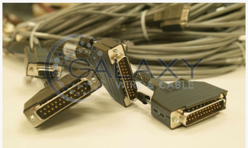
Black overmolded cable assemblies