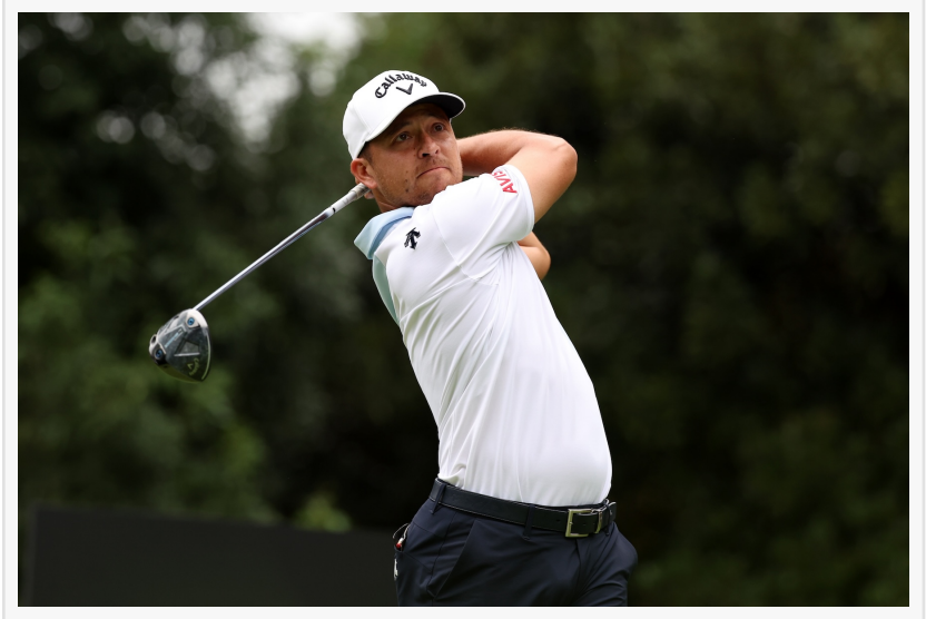
No. 2-ranked Xander Schauffele