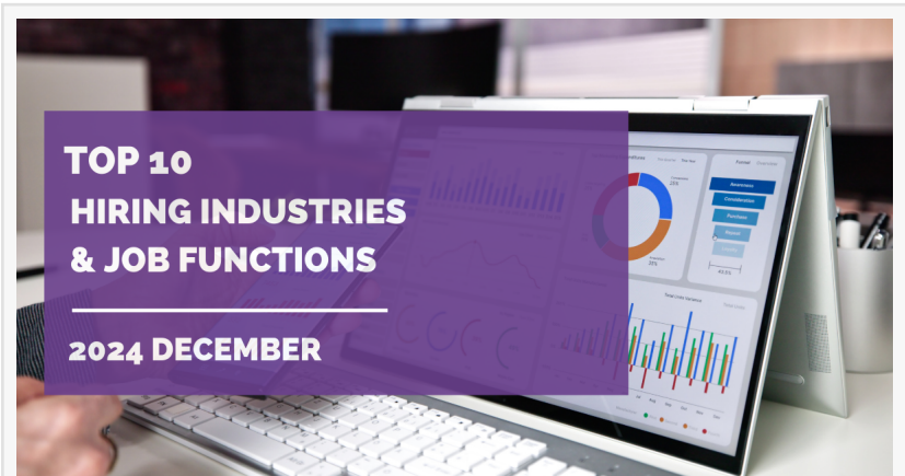
2024 December - Monthly Hiring Insights on JobNet.com.mm