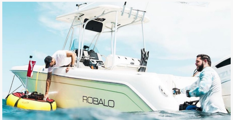
A boater prepares for a dive by placing Brownie's SeaLiOn battery-powered tankless dive system into the water.