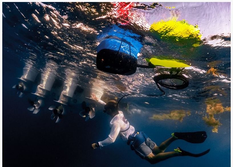
BLU3's Nomad & Nomad Mini are the perfect tools to use under your boat!

Following its recent debut at CES 2025, the SeaNXT Elite will be on display. Engineered with carbon fiber for enhanced durability and weighing just 22 kg, this advanced underwater scooter features live GPS tracking, dual-motor propulsion, and a low-turbulence impeller system. Its