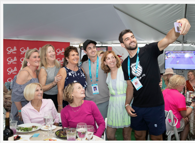
Delray Beach Open Food & Wine Series

Schedule for the Delray Beach Open Food & Wine Series: