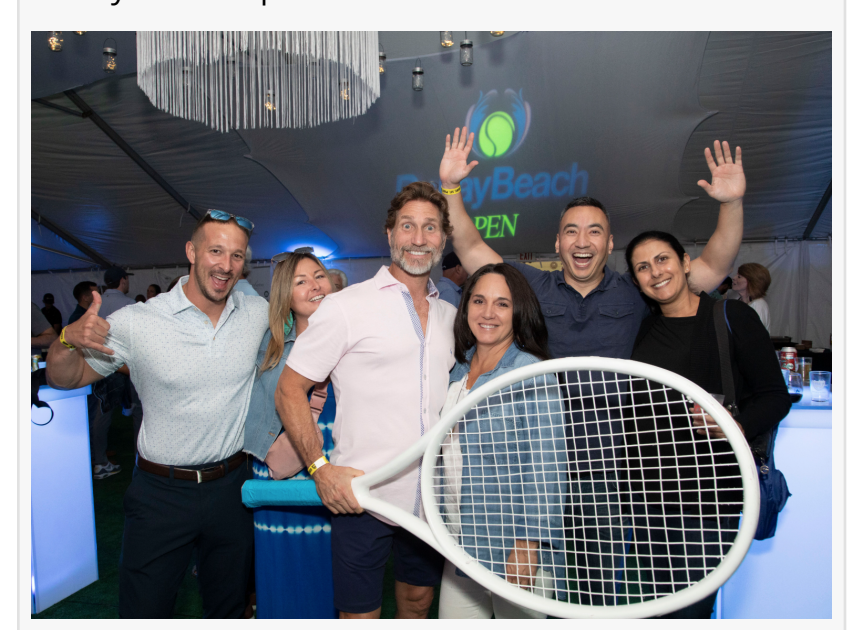
Delray Beach Open Food & Wine Series