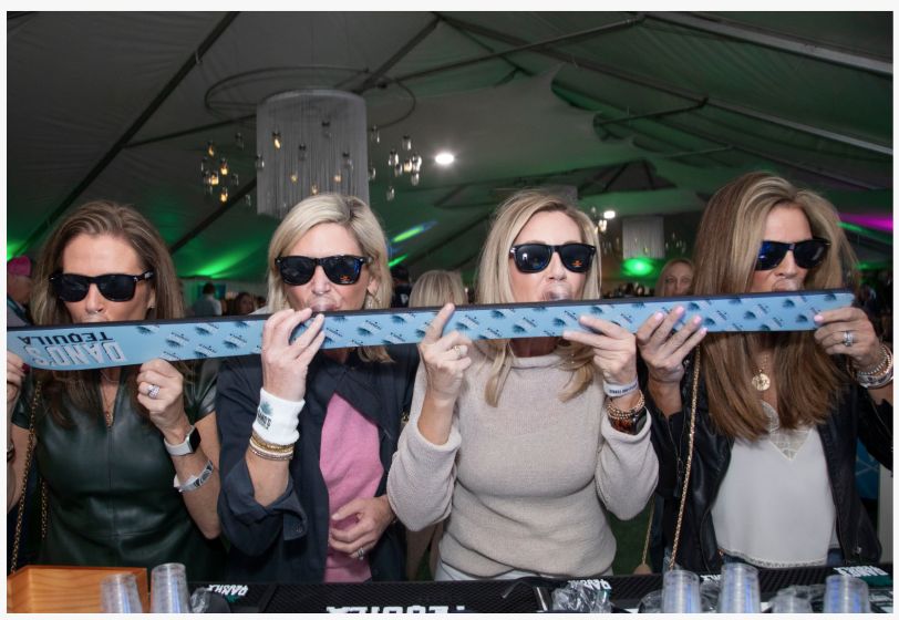
Delray Beach Open Food & Wine Series