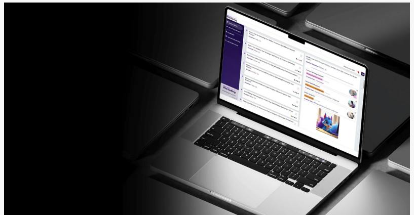
Image showing 3 of the AI Agents inside Next Level Marketing working on the client's marketing tasks

Following successful trials during Alpha phases and Closed Beta, Early Access has already proven transformative, with over 1,189 units sold worldwide since November 22, 2024.