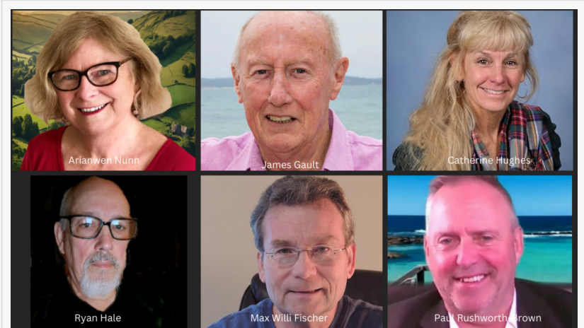
The best new historical fiction authors of 2024 as chosen by World Books

"This is an enthralling novel. It's two novels in one: the minor story of an English teacher named Caitlyn trapped in a loveless life, and the major story that Caitlyn discovers: the incredible romance between outlaw Donal Donn and the young noblewoman Mary McElroy. The major and minor characters in the book demonstrate the gamut of human characteristics, from depravity