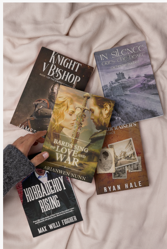
Readers looking to immerse themselves in captivating tales of ambition, resilience, and romance will find these books an irresistible addition to their collection.