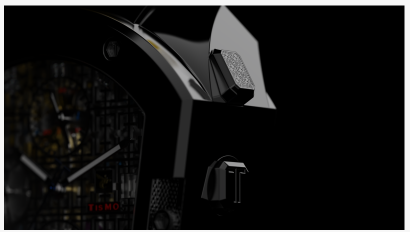
Oleksandr Usyk watch collection with Tismo Geneve

Additionally, the watch loop straps are crafted from Usyk's training gloves, worn during his preparations for his first fight against Tyson Fury. Each watch is authenticated with a certificate of authenticity personally signed by Usyk, amplifying its value and prestige.