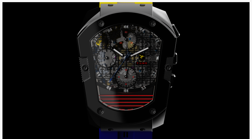
Oleksandr Usyk watch collection with Tismo Geneve