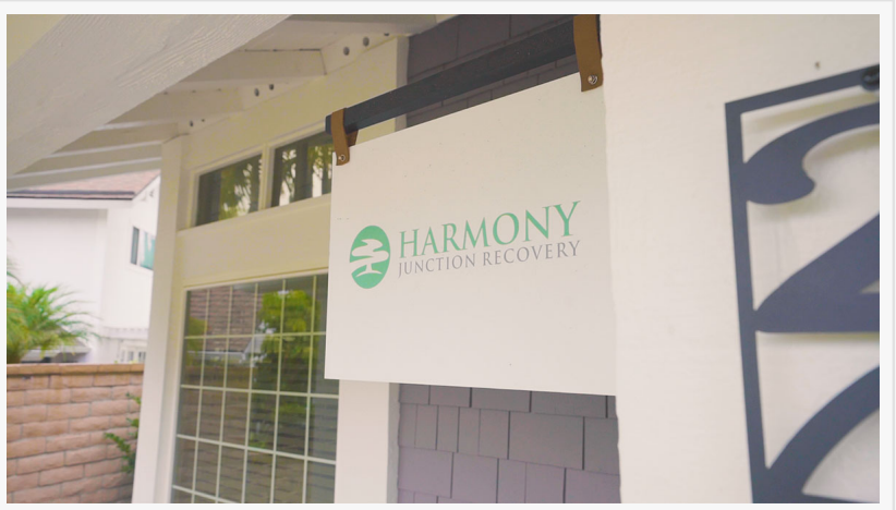
Harmony Junction Recovery presents new alcohol rehab facilities in Orange County

Luxurious Amenities: The facility features comfortable, well-appointed accommodations, serene outdoor spaces, and recreational areas to promote healing in a tranquil environment.