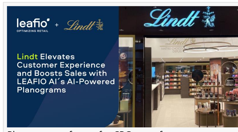
Planogram software for CPG manufacturers

LEWES, DE, UNITED STATES, December 17, 2024 /EINPresswire.com/ -- Lindt, the world-famous chocolate producer, has chosen LEAFIO AI <u>Planogram</u> <u>software</u> to optimize operations in its nearly 80 stores across Brazil.