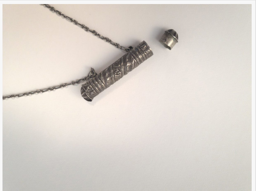
Ottoman silver scroll holder the author received for his 18th birthday with a protective blessing from his mother

This press release can be viewed online at: https://www.einpresswire.com/article/768632621