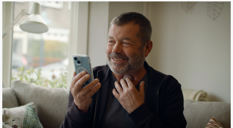
Whispp enables people with voice disabilities to speak again