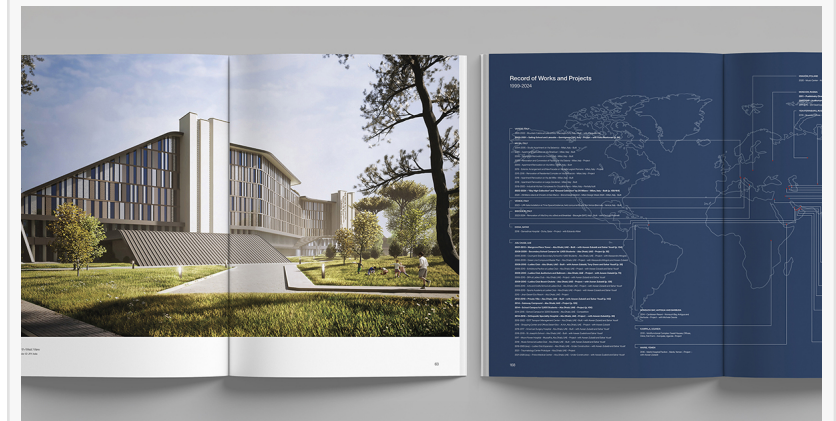
Paolo Lettieri Monography Hotel and Map