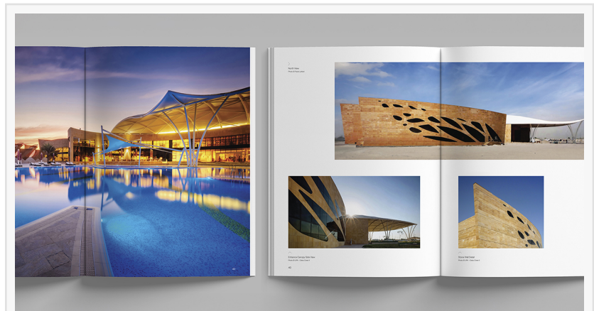
Paolo Lettieri Monography Abu Dhabi Ladies Club