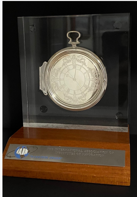
John Harrison Award, replica A4 chronometer with permission of the Royal Observatory/Royal Museum Greenwich