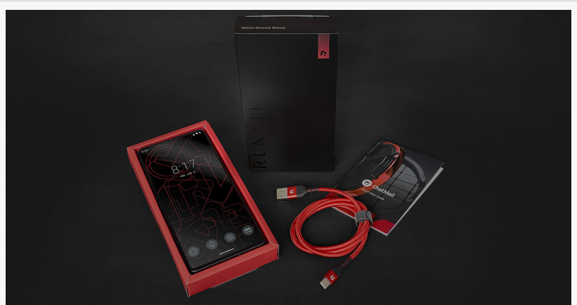
ChatMail on Renati Mobile Security Solution

CALGARY, AB, CANADA, December 11, 2024 /EINPresswire.com/ -- Myntex, a leading provider of mobile device security, is taking decisive action to address the growing threat of cyberespionage and data breaches. In the wake of the recent Chinese hack on U.S. telecommunications networks, the ongoing exploitation of mobile devices and the ineffectiveness of unstandardized encrypted platforms, Myntex is launching its new e-store providing direct access to its mobile security solution for Canadian and U.S. consumers.