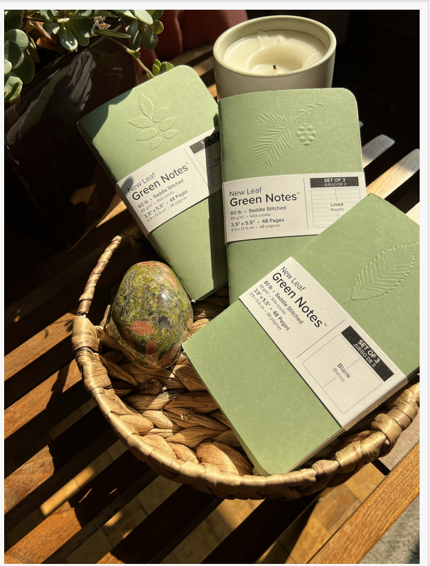
Pocket-sized Green Notes<sup>™</sup>: sustainable memo books made from 100% postconsumer recycled paper, helping to protect endangered trees in North America. Perfect for jotting down your thoughts while making a difference for our planet.

New Leaf Green Notes are crafted from 100% postconsumer recycled fiber, eliminating the need for virgin materials and significantly reducing energy and water consumption during production. Chlorine-