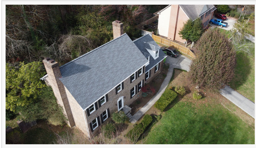
residential roofing client photo

As part of their launch celebration, the company is offering complimentary comprehensive roof inspections. This no-obligation damage assessment provides homeowners and business owners with expert recommendations for roof maintenance, helping them protect their most valuable assets. The inspection service is designed to give property owners peace of mind and