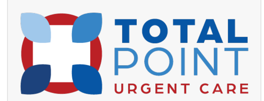
Total Point Urgent Care

Coming soon, TeleHealth and online booking will make accessing care even