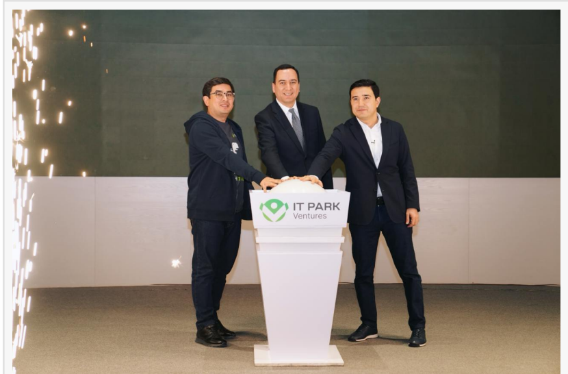
Launching of the IT Park Ventures

The fund intends to support startups at various stages of their development by offering significant investment opportunities. For example, startups at the ideation stage can receive funding ranging from $10,000 to $30,000, while those with a Minimum Viable Product (MVP) may