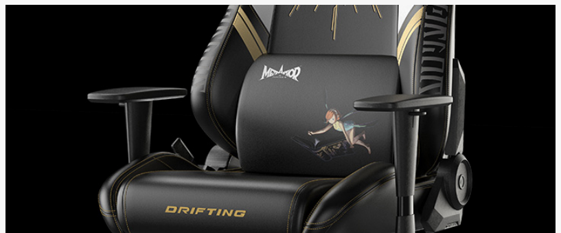
Metaphor: ReFantazio gaming chair Lumbar Pillow