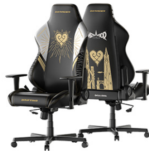
Metaphor: ReFantazio gaming chair