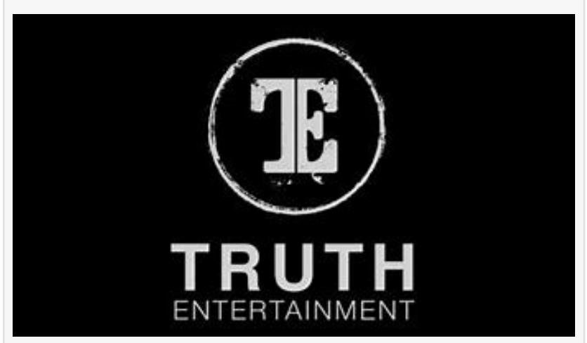
Truth Entertainment acquires exclusive motion picture and audiovisual rights to Dragonetti's novels

This press release can be viewed online at: https://www.einpresswire.com/article/766548014