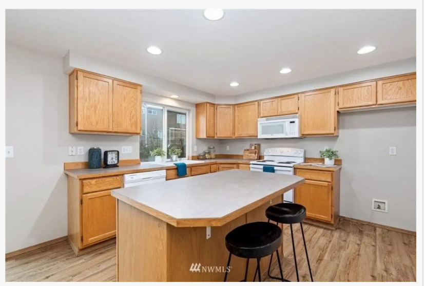
Cabinet Painting in Greater Seattle