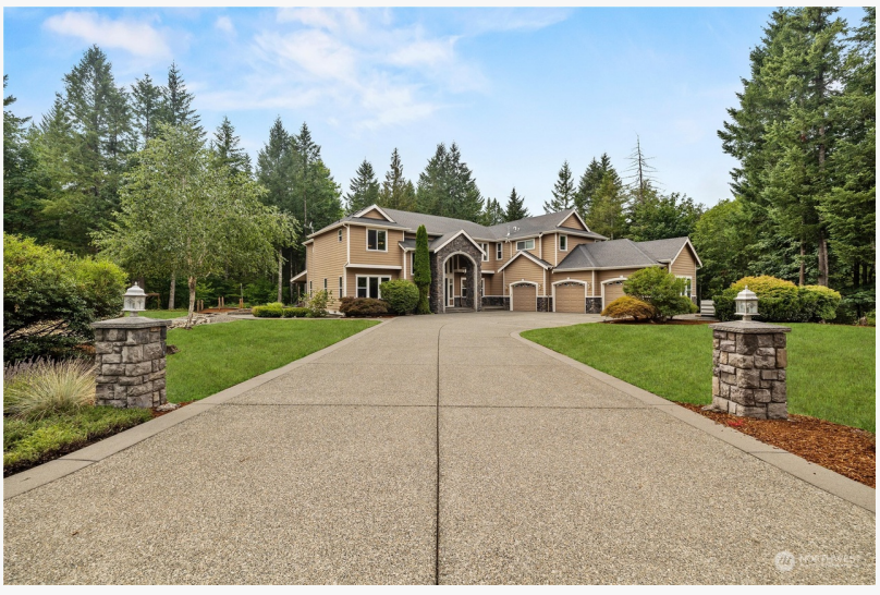
Exterior Painting in Greater Seattle